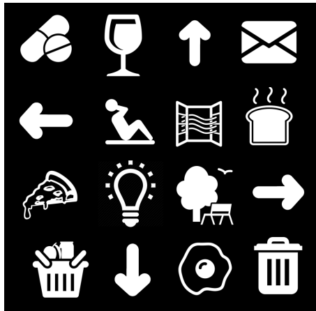
Figure 2: The grid of the P300 speller that is shown to the LIS patient.

On the proxy side, we used AR glasses to display selected items. We implemented our application for the Microsoft HoloLens, using the Unity engine as a platform. The speller already integrates a network interface which was used to send the selected elements to the proxy. The application receives the message and is able to display the selected item that is then sent via TCP to the HoloLens application. Those actions are then shown to the proxy in the form of a three-dimensional arrow object or as an icon. This object is displayed in the wearer's field of view for three seconds, every time an element is sent.