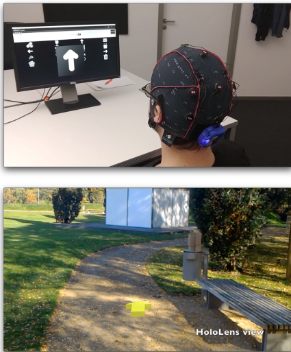
Figure 3: A static person operating the P300 interface to communicate navigational directions with the proxy through augmented reality glasses (i.e., HoloLens).