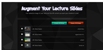
Figure 2: The web application GUI. A list of already created AR slides is displayed in the middle. Two buttons are shown as well: one to create a new AR slide, and the other to delete any chosen slides.

Arvanitis et al. used an interactive educational system to introduce abstract concepts like airflow, magnetic fields and force variables to students with physical challenges. The interactive educational system enhanced the learning experience of the disabled students.